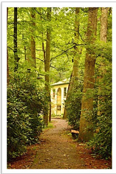
Strolling through the trees of Mount Gretna

The Schocks' goal of preserving the park was to provide a playground for future generations to enjoy being in unspoiled nature. However, the failures of the current stewardship plan are having a negative impact on visitors. Instead of being a happy playground, people are sad and angry about the destruction they see when visiting and some say they will not come back because it's too upsetting—opposite of the Schocks' intent.