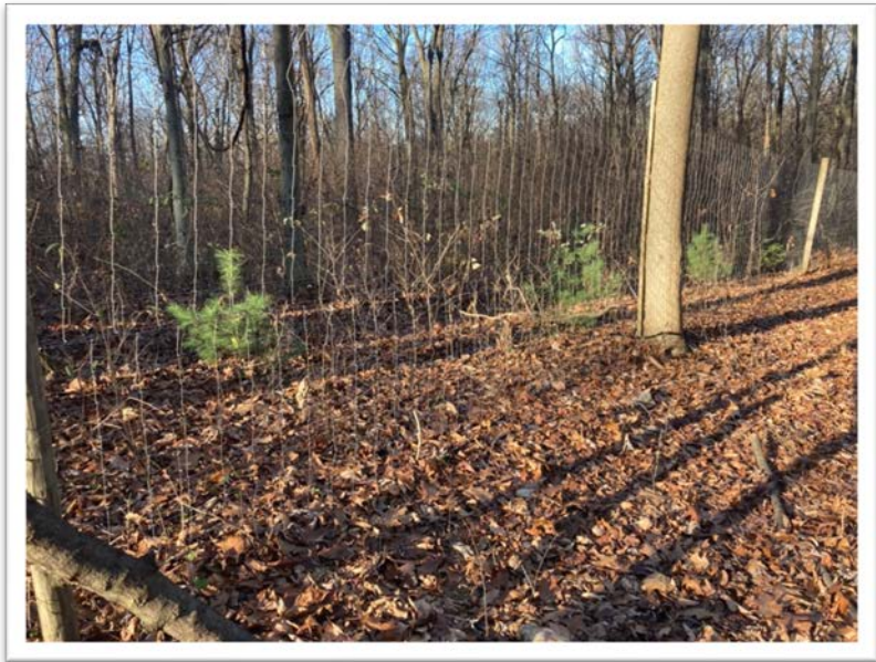
White pines behind fence