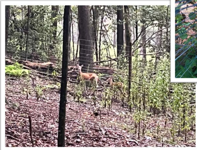
Deer inside fence intended to keep them out