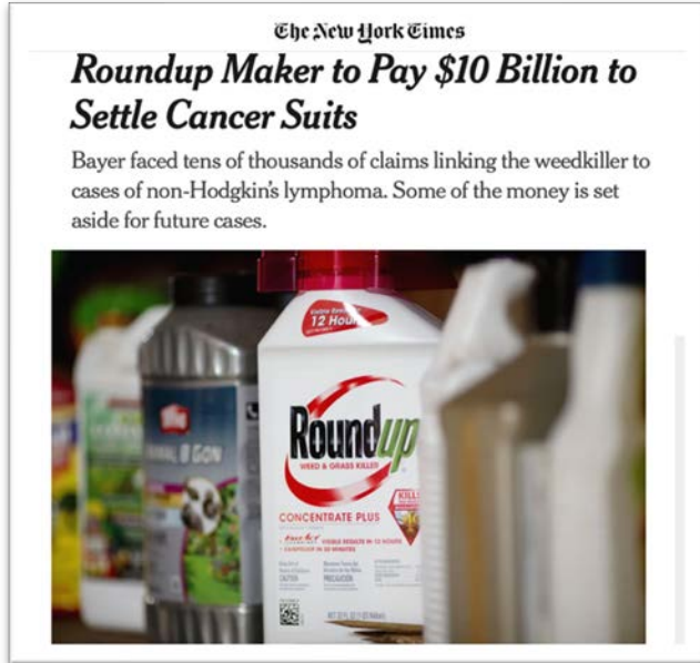
June 24, 2020, New York Times article informing public of a settlement reached in one of the lawsuits relating to the dangers of the herbicide Roundup

as it's negative impacts to human health and the environment come to light. This issue is of particular concern to the residents of Mount Gretna.