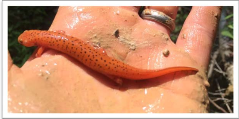
Amphibians are among the sensitive species threatened by environmental changes

The forest is more than the trees; within Governor Dick Park, an interconnected web of life exists between the plants, animals, and fungi that call it home. The stewardship plan is doing irreversible harm to this sensitive ecosystem by altering the habitat that supports life within the park. Although still technically a “woodland” after logging; the ecology of the site becomes simplified, lacking the resources needed to support species that used to live there.