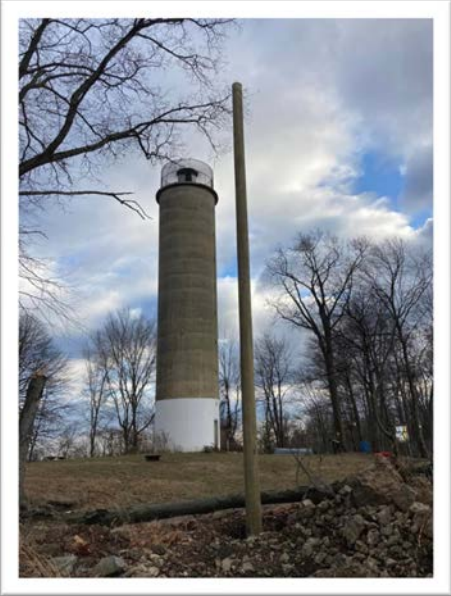
One of the newly placed utility poles for lights and cameras around the tower

At great expense, power and communications lines are being run to the tower for lighting and security cameras. The intention is to deter vandalism, drug overdoses, and teens partying after hours. Cameras are unlikely to end drug use or dissuade most vandalism and partying teens can set up elsewhere. Graffiti on the tower could be painted over thousands of times for the price of this project. Beyond its level of effectiveness, the presence of surveillance and lighting will negatively impact how people feel about being in the space and the light pollution at night will negatively impact wildlife. The lights on top of the tower will soon be visible from the town of Mount Gretna.