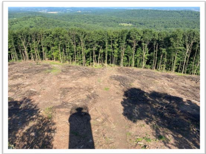
Significantly more trees cut than needed to open view