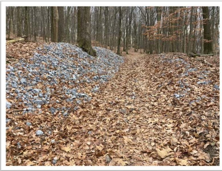
Bluestone riprap to stabilize an embankment may be utilitarian and effective but in a natural forest setting looks out of place and ugly

With some notable exceptions like new trails built by the mountain biking community and the handicapped access boardwalk, work done within the park tends to be heavy handed and clumsy. I am acutely aware of this because in my own career as a landscape artist my focus is attending to the aesthetic needs of the Mount Gretna community. My family visits many parks including an annual hike of Ricketts Glen and I see what level of care and craftsmanship can go into trail work but