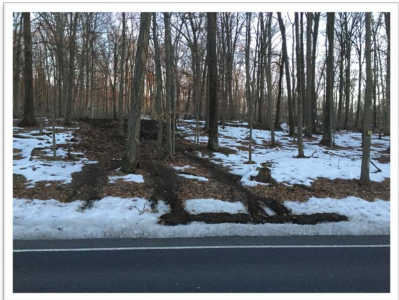
Erosion, soil flowing out of timber harvest site and into the watershed