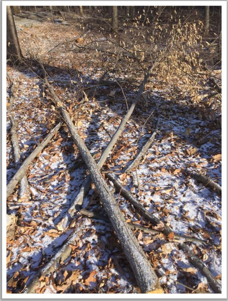
A small oak lay over a beech tree, life cut short many years before their time

The forester uses a skid loader attachment to mow down thousands of immature trees to allow the maximum amount of sunlight to hit the forest floor to encourage the growth of new saplings. These trees were the next generation waiting their turn to fill in any openings in the forest canopy.