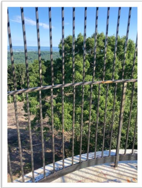
View of mature trees left to block part of the view, making clear-cutting of the trees beyond moot