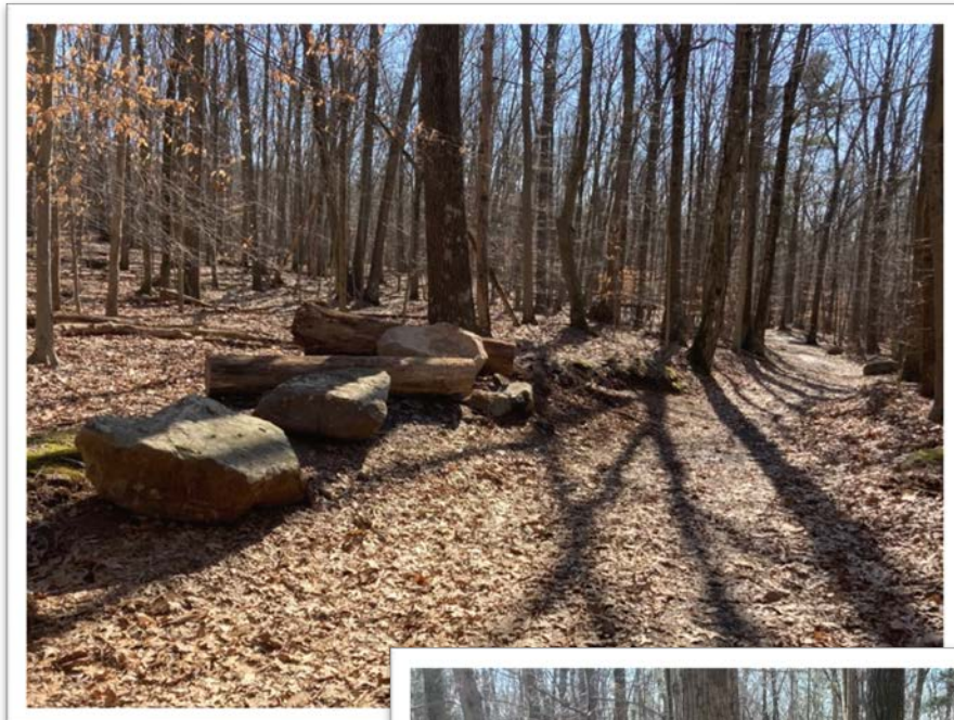
The board had an excavator block 30-year-old biking trail features along trail five by haphazardly placing logs and boulders in an unnatural fashion

There is an unhealthy relationship between the park's board and the mountain biking community. Mountain biking is a popular and growing sport and represents one of the largest user groups of the park and one of its largest sources of volunteer labor; yet their place in the park is tenuous. They have been threatened with loss of access and so they work hard to meet the requests of the board providing volunteer labor and their leadership doesn't speak out about their ill treatment to stay in the board's good graces. Their efforts have often been disrespected or been undone wasting many man hours given to the park.