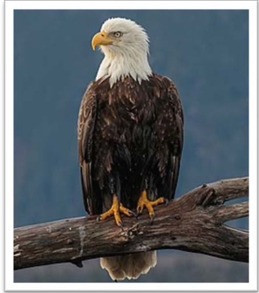
Bald eagles are protected under the Bald and Golden Eagle Protection Act and the Migratory Bird Treaty Act

Nearly seven (7) acres were clear-cut to open the view from the observation tower. While opening the view from the tower may be a worthy justification for cutting down some trees, significantly more land was cleared than necessary to achieve this objective. Several mature trees left standing near the tower effectively block the view that would have been opened by the several acres of clear-cut beyond, rendering that cutting useless. This clear cutting was carried out during spring nesting season in a callous disregard for nature.