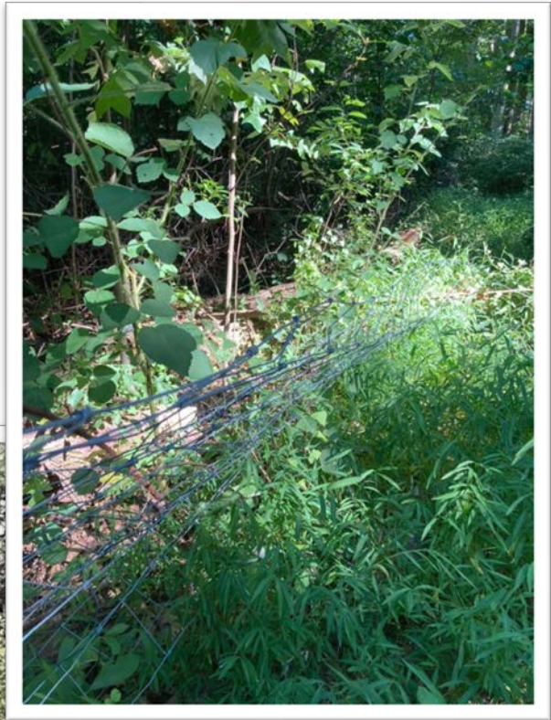
Broken down fencing out-of-sight of park visitors

The deer exclusion fencing installed after timber harvests is not maintained adequately enough to keep the deer from within the fenced area. Most regular park visitors can say they've seen deer inside the fencing. The success of the stewardship plan hinges on successfully keeping the deer out of timbered areas for a 10-year time span, the regular presence of hungry deer inside the fencing negates all efforts to regenerate the forest from seedlings.