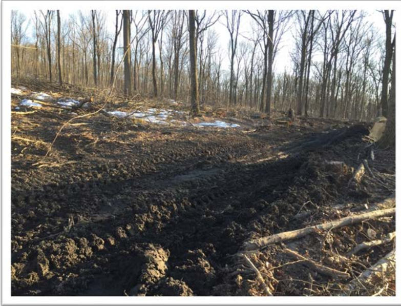
Muddy ruts left by heavy logging equipment compacting the soil and priming the site for erosion

Extensive use of heavy logging equipment degrades the forest soil by compacting the ground and significantly disturbing the soil, making it subject to erosion. Compacted soil inhibits root growth and cuts off the flow of water and nutrients underground. Erosion carries away precious topsoil removing it from the forest and creating sediment pollution downstream.