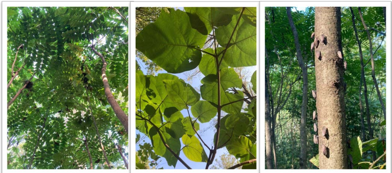
Recent timber harvest site carpeted in invasives; canopy of invasives in timber harvest areas—princess tree, devil's walking stick, lantern fly breeding grounds direct result of stewardship activities.