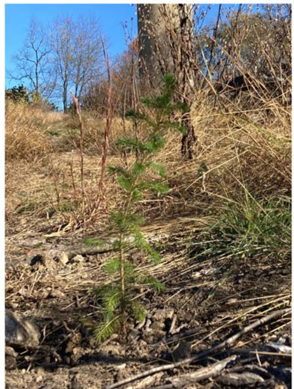
Newly planted sapling by the Cedar Crest Key Club will be killed by herbicides

In a recent example of poor administration, the Cedar Crest Key Club, of which my son is a member, was led to the site of the tower clear-cut for a tree planting event; this was a waste of the students' time and of sapling trees as this whole site is to be treated with herbicides next spring prior to being planted as meadow and low growing bushes and trees.