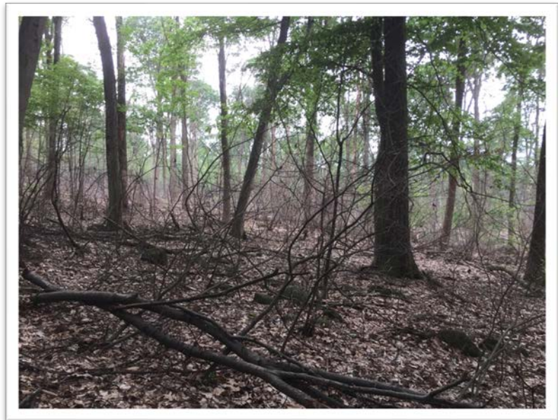
Over drift of herbicide killing vegetation outside of area to be logged