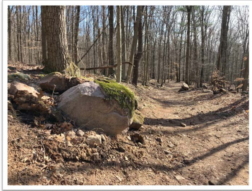
Hazardous placement of a boulder to stop bikes from riding on a slope posed a safety risk to park users