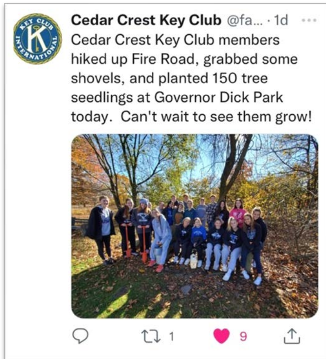
Twitter post of members of Cedar Crest Key Club, proud of their work at Governor Dick

Although efforts of current employees and volunteers at the park are commendable, the park is suffering from poor administration and has been unable to recruit a new Executive Director. Compensation and benefits offered for the executive director's position are not commensurate with the necessary qualifications and the demands of the job. Additionally, the park has been unable to effectively maintain a social media presence or a modern website.