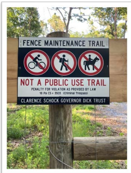
Sign criminalizing even walking on a trail in the park

The fence maintenance trail around the new 40-acre deer exclusion fence has been posted with signs stating anyone using the trail is guilty of criminal trespass. This posting came in response to the public outcry caused by the closing of other older maintenance trails, with logs and boulders, after fencing had been removed. Those maintenance trails had run parallel to some of the park's main trails and were popular among park users, especially during the pandemic when park usership surged and these parallel trails allowed for social distancing and made it easy for hikers, bikers, and equestrians to pass each other safely. To avoid a repeat of this public outcry 10 years from now, with the scheduled removal of fencing and trail, the board has criminalized even using it in the first place (this is antithetical to the Schocks' intent for the park).