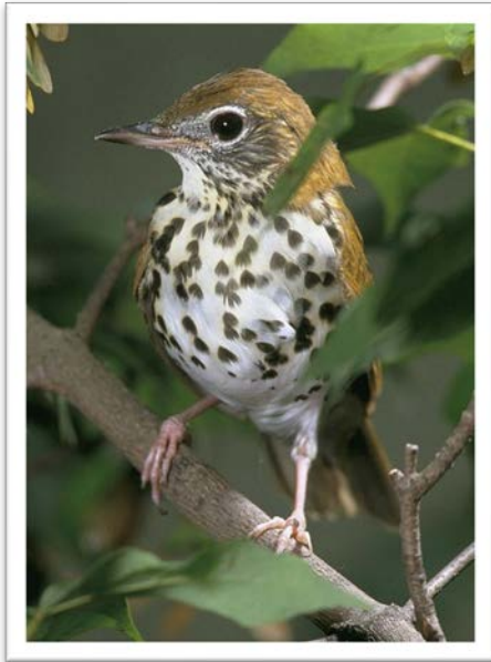
Wood Thrush is included on the Yellow Watch List for birds most at risk of extinction without significant conservation actions to reverse declines and reduce threats.

The risk to trees of being blown down by high winds is greatly increased by opening the canopy. Mature trees that grew tall together in the forest and moved together as one in the face of storms are ill-prepared to stand against the winds alone.